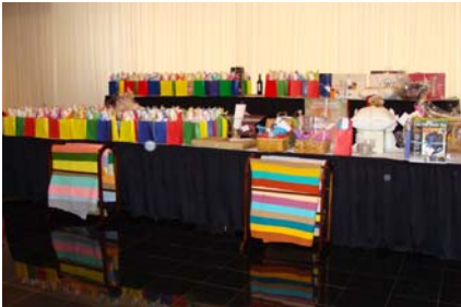
(Left) What would the Fall Benefit be without the RRAF raffle?

Many guests are now shopping, dining, and enjoying new things for their homes all made possible by wonderful year after year donors. Thank you all.