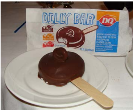
(Left) Dessert for the day was donated by the Addison Dairy Queen. "Dilly Bars" for all !!