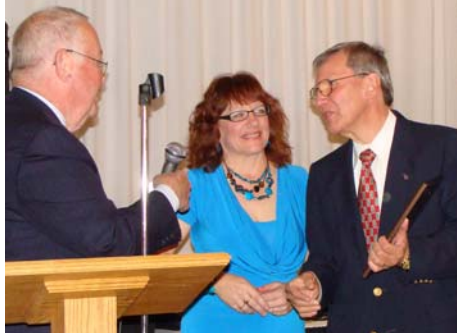
(Right) We were able to welcome and thank new RRAF friends this year, the Knights of Columbus, Saint Joachim Council # 15296.

Thank you to all of our Knights of Columbus friends who are always there for us.