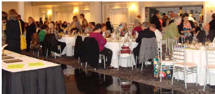
(Above) Over 260 guests filled the room at The Empress Banquets. Our goal is always 300 plus so please put October 6, 2013 on your calendar NOW and plan on attending. See you then!